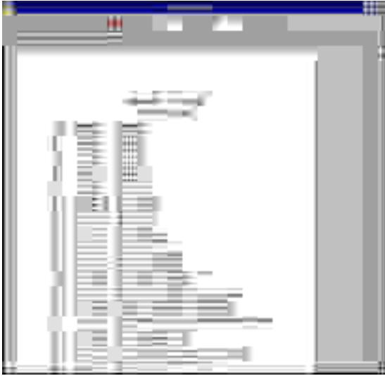
Generating a list of Forms.