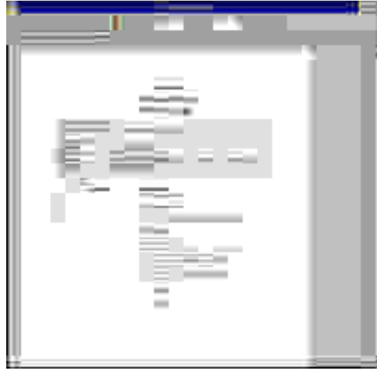
A detailed list of the Forms.