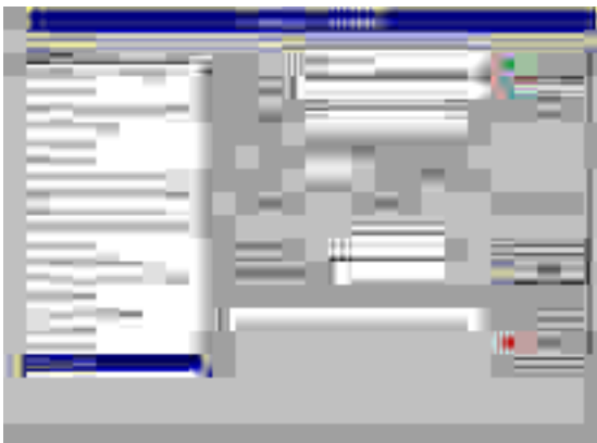
Configuring a variable.