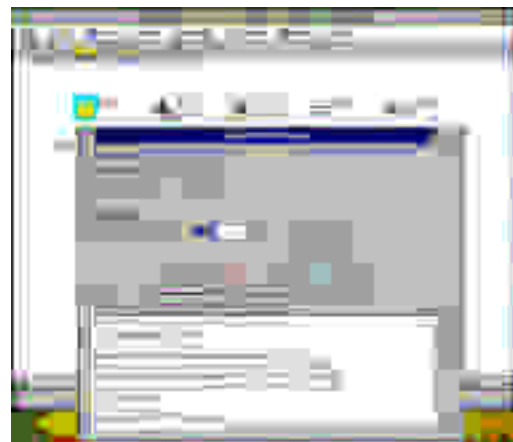
Analyzing the bit timing.