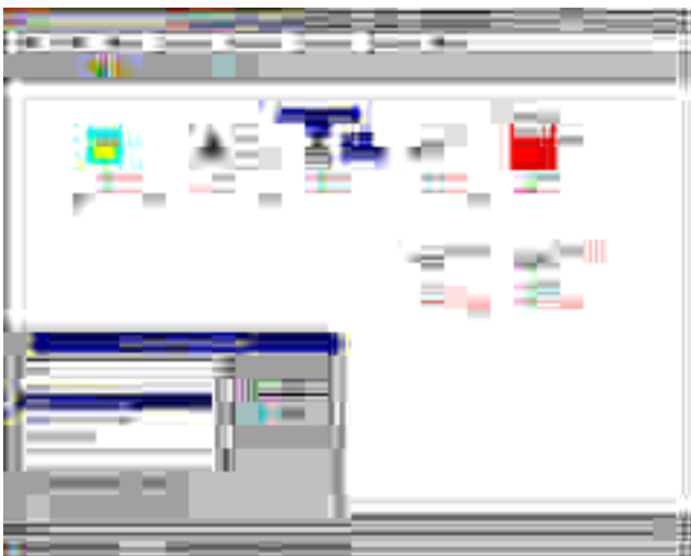
Checking the connections in the system.