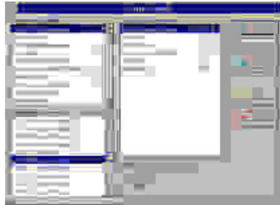
Defining the layout of a Form.